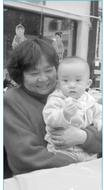
Chinese New Year Celebration (see page 5)