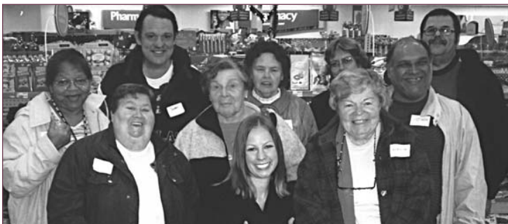
On Thursday, Nov. 16th the RTH Walking Group went on a CVS/Pharmacy ExtraTour in Allston. The store pharmacist gave them a tour of the store, while speaking about generic drug alternatives, drug interactions, vitamins, and other helpful tips on health and well being. The walking group had a lot of fun!