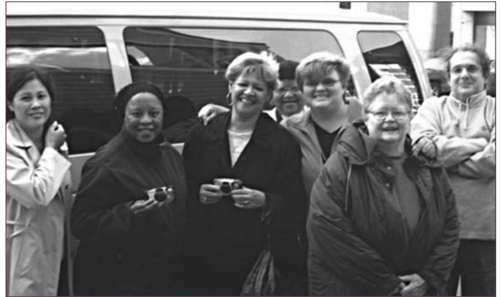
Arts and Crafts class participants prepare for a special trip to the Arboretum in JP. This class meets every Wednesday from 10-12 in the Flynn Kitchen. Everyone is welcome! A trip to Museum of Fine Arts is being planned for after the New Year!